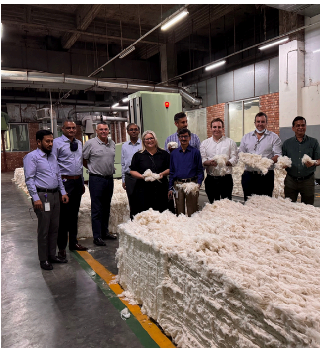
Viewing Australian cotton in laydown at Square Textiles.

An Australian Cotton Seminar, hosted by Austrade in Dhaka, reinforced the value proposition of Australian cotton and the opportunities for increased trade into the market. The seminar was officially opened by the High Commissioner, HE Ms Susan Ryle, further cementing the importance of Australia-Bangladesh ties.